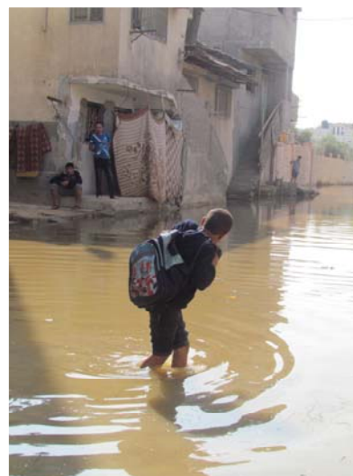
Sewage in the streets, Gaza city, 13 November 2013

It is estimated that in November, less than 20,000 liters of fuel per week entered Gaza via the tunnels, compared to nearly 1 million liters per day until June 2013. The Gaza Power Plant (GPP), which until recently supplied 30 percent of the electricity available in Gaza, has been exclusively dependent on Egyptian diesel smuggled through the tunnels, since early 2011. On 1 November, after depleting its fuel reserves, the GPP was forced to shut down triggering power outages of up to 16 hours per day, up from 8-12 hours prior to that.